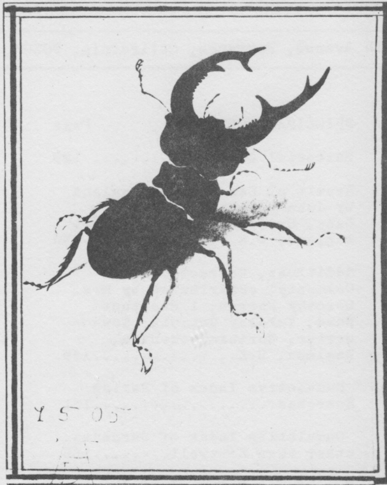
ALBRECHT DÜRER (1471-1528) "Stag-beetle"

GENEALOGIC AND HERALDIC CHRONICLE OF THE HARTWELL AND ALLIED FAMILIES