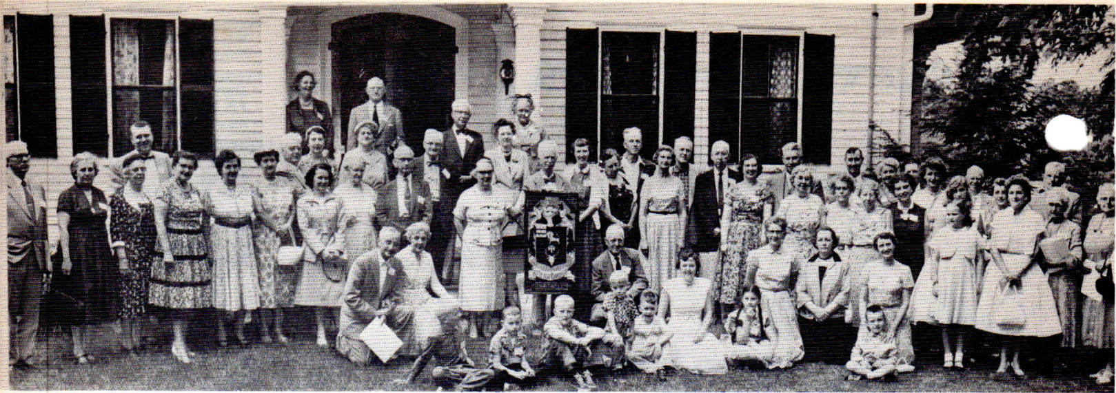
19th HARTWELL MEETING - North Hampton, N. H. 1956