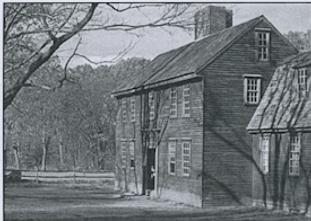
Hartwell Tavern, Lincoln, Massachusetts