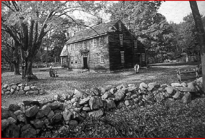
Hartwell Tavern, Lincoln, Massachusetts

The Eighty-Sixth Anniversary Reunion & Business Meeting of the Hartwells of America will be held Live & in Person on June 24, 2023 at the Trinitarian Congregational Church, 54 Walden St, Concord, Massachusetts