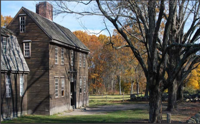
Hartwell Tavern, Lincoln, Massachusetts

Hartwells of America 385 S. Main St. Attleboro, MA 02703-6409