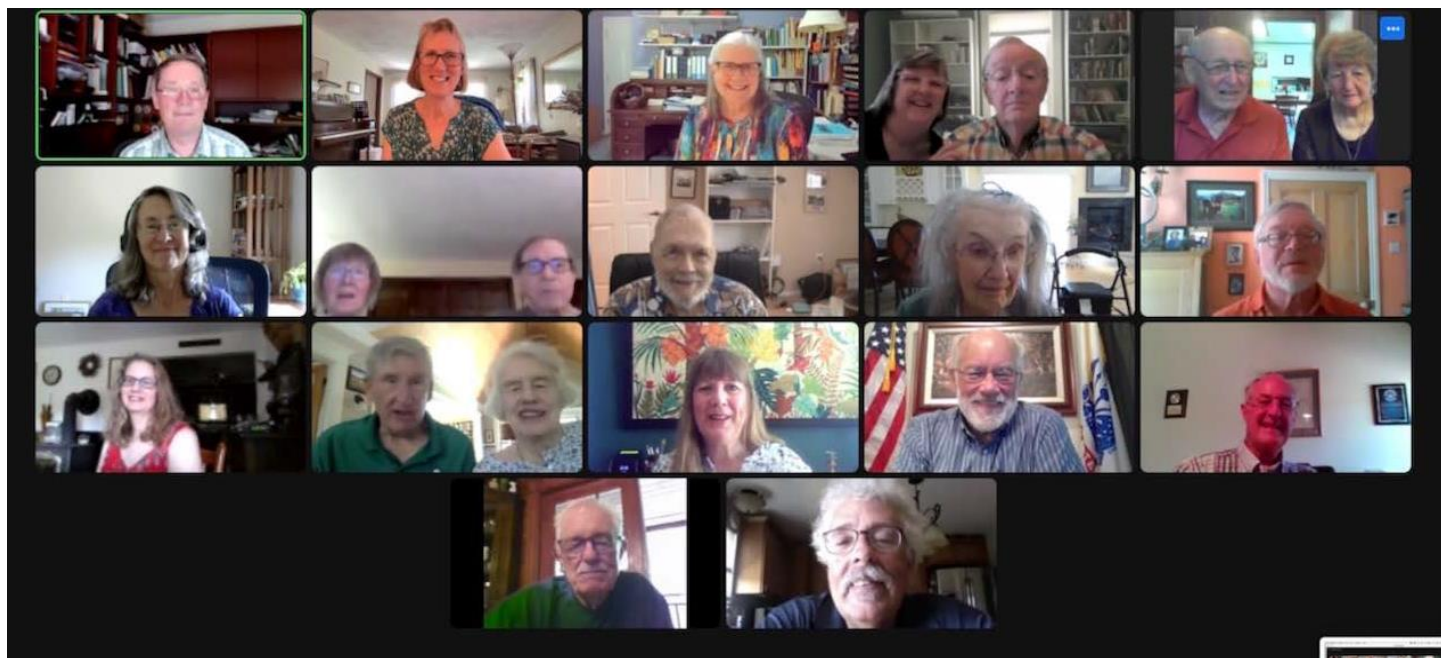
Left to Right, by Row